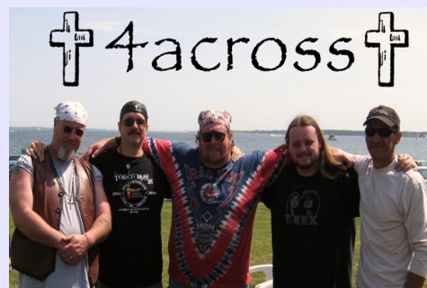
4 A Cross, playing this Friday at the Harvest Cafe!