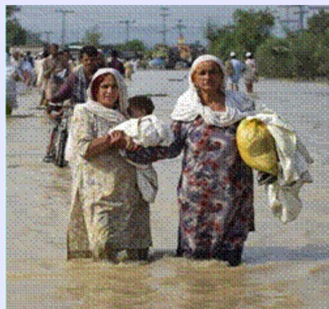
The Crop Walk assists families affected by the Pakistani floods as well as those affected by hunger locally.

With the arrival of September we think of school supplies, vacation memories, falling leaves, and cooler weather. At Christ Church, we think of the Bible. We think a lot about the Bible.